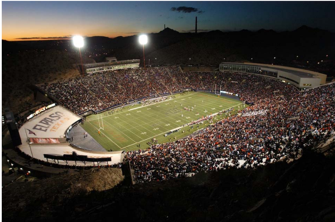
▶ UTEP's campus and football field, Sun Bowl