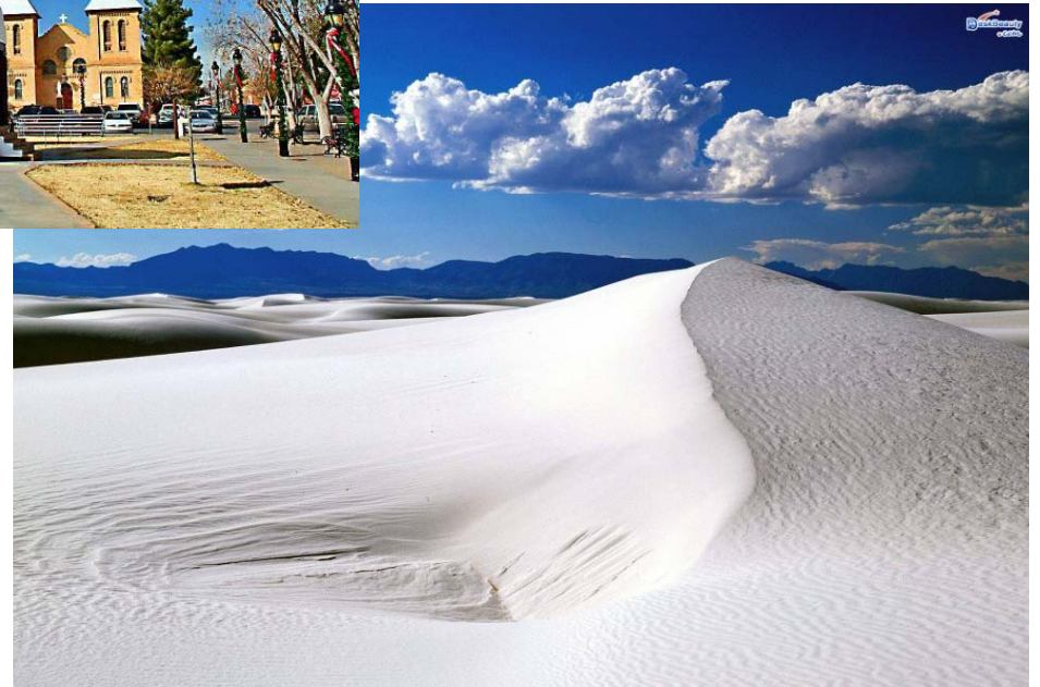
► Places of interest around El Paso: Carlsbad caverns, la Mesilla, White Sands...